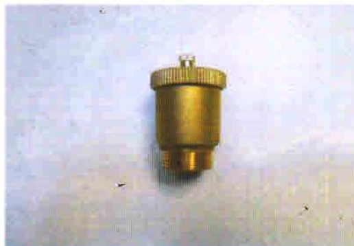
Test Sample (1'')