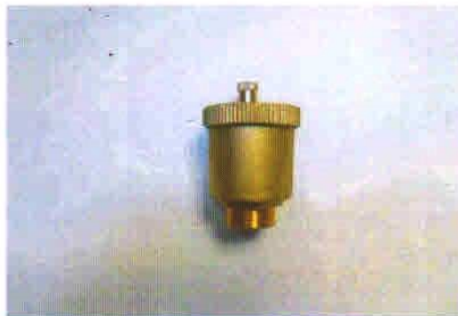
Test Sample (3/4'')