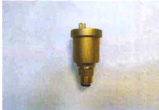
Test Sample (1/2'')